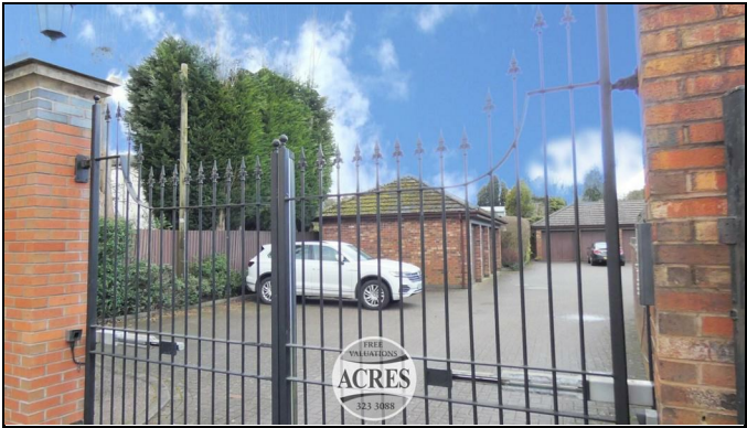
Tudor Park Court, Sutton Coldfield, B74 4QH